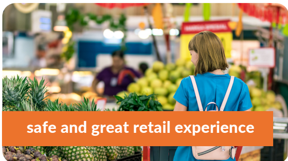
safe and great retail experience