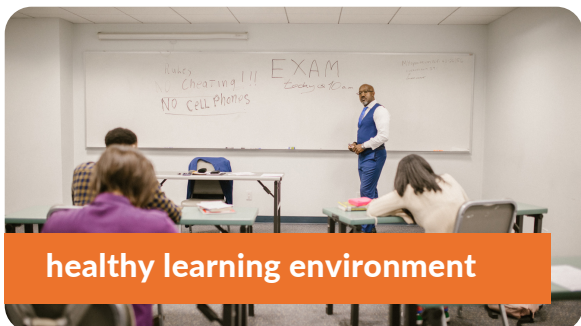
healthy learning environment