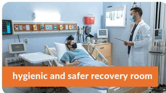
hygienic and safer recovery room