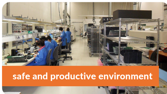
safe and productive environment