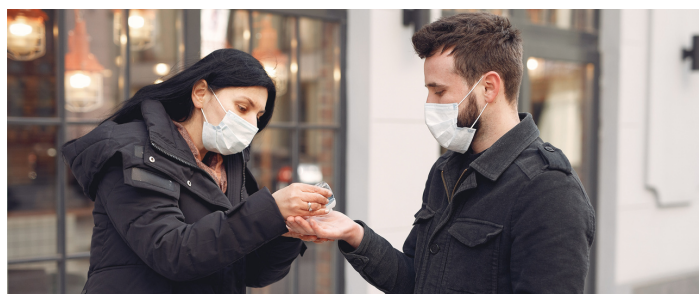
Hand sanitiser for up to 24 hour germ protection