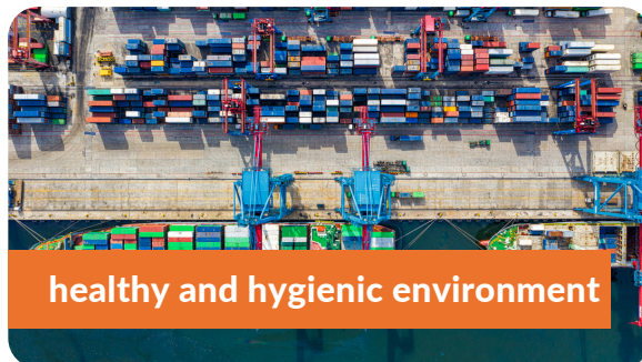
healthy and hygienic environment